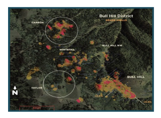
Bull Hill District Grade Shells

REE mineralization is widespread on the property. However, the area proximal to the Bull Hill and Whitetail diatreme bodies is believed to be the most prospective for significant REE mineralization.