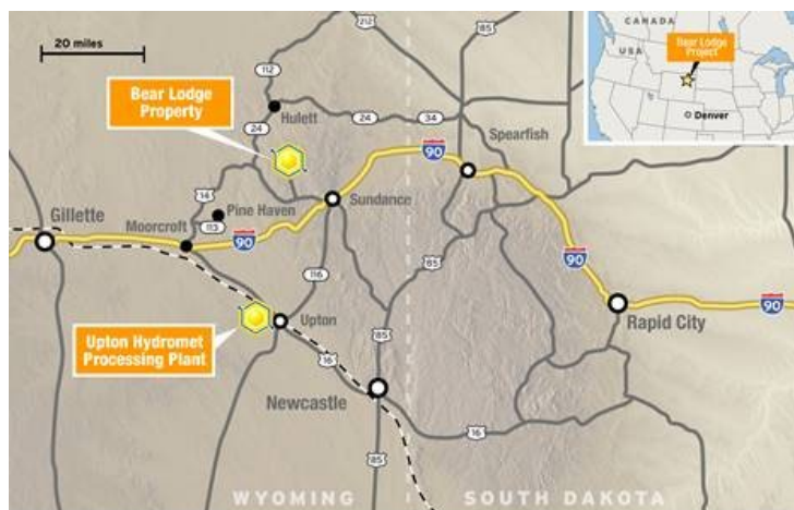
Bear Lodge Property – Location Map

We control 100% of the mineral rights at the Bear Lodge Property, consisting of unpatented mining claims and a right of repurchase on adjacent private land (Section 16). We hold 499 unpatented mining claims located on land administered by the USFS. The Bear Lodge Property is located within parts of Sections 5, 6, 7, 8, 9, 14, 15, 16, 17, 18, 19, 21, 22, 23, 26, 27, 28, 29, 30, 31, 32, 33, 34 and 35 in Township 52 North and Range 63 West, Sixth Principal Meridian, Crook County, Wyoming. All of the public property mining claims are unpatented, such that the paramount title to the land is held by the U.S. All of the mineral resources identified in the TRS are located on mining claims that we hold.